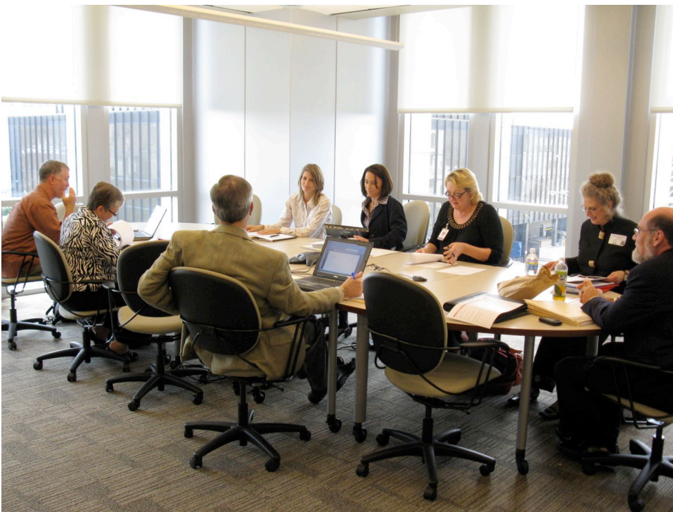
Members of the Behavioral Health Professionals Working Group at a meeting earlier this year. The group is working at the request of the Legislature to develop agreed upon language for legislation and collaborative approaches to serve LA's citizens.