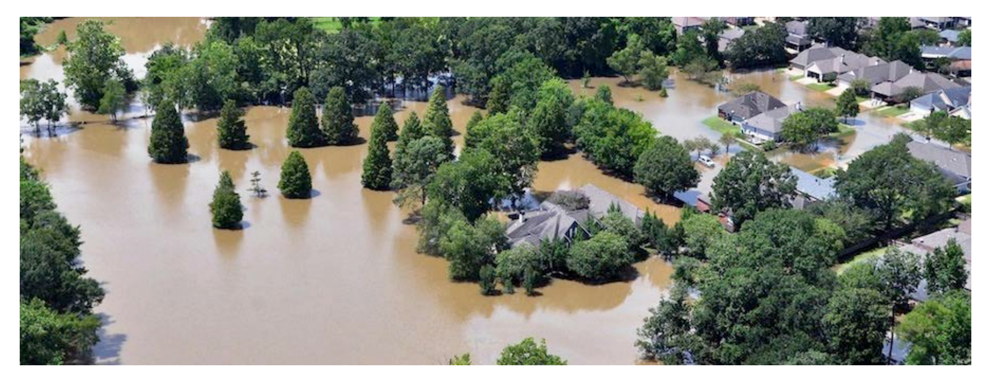
What is now being called The Flood of 2016 killed 13 and damaged over 60,000 homes. Experts say many are still in shock.