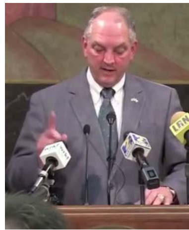
Governor Edwards expressing himself after finally getting a workable budget.